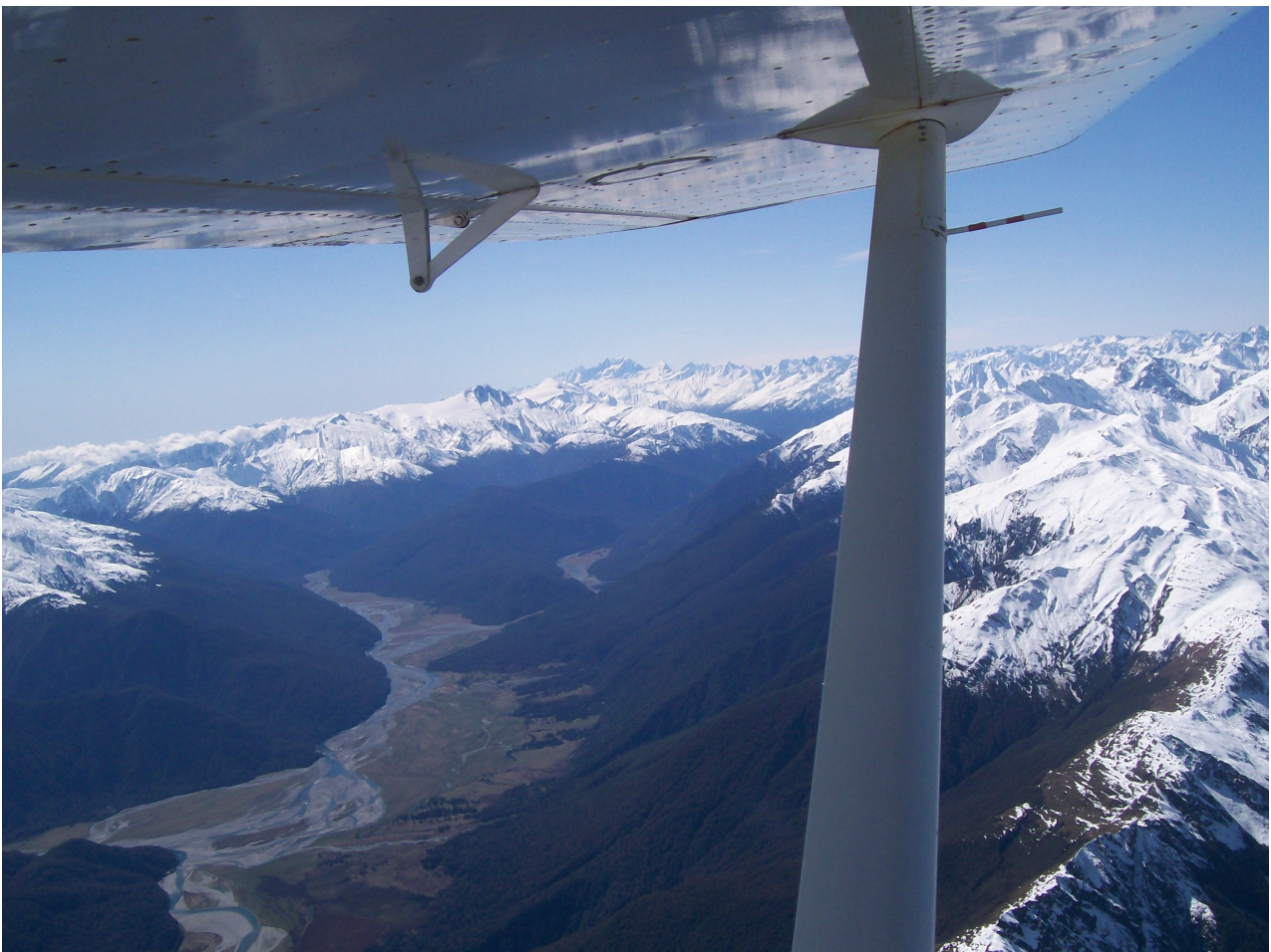
Looking up the Landsborough and Clarke rivers north to Mt Cook.

Be on your best behaviour, fly as if your worst critic is watching you, and show them the joy of microlight flight in a professional and responsible manner!