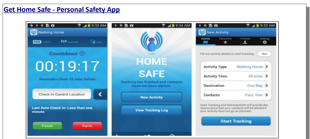
Free App - Unlimited Use - GPS & heaps more

It's probably worth mentioning for those fractionally uncurrent with radioing up airways, it's still free to call Flight Information (FISCOM) and leave a current position/ETA/and any other info with them, even without a flight plan lodged with IFIS . It works well hand in hand with a tracking app.